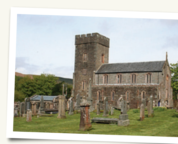
The old church of Kilmartin and surrounding graveyard

are buried there in a vault. The Church of Scotland still maintains the building for periodic services, and the elders kindly let us enjoy the artifacts and ambiance of the old Reformation era church.